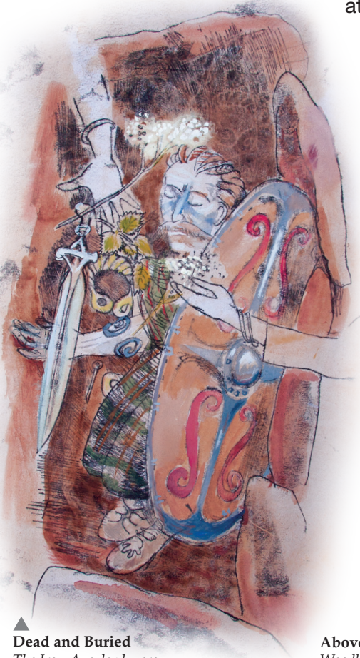
Dead and Buried The Iron Age dead were sometimes buried in stone-lined cists

The ancient enclosure at Woodhouse straddles a rocky outcrop close to the northern end of the Cheshire Sandstone Ridge. Roughly 4½ acres of the hilltop are secured by a stone-faced rampart that curves around the gentler slopes to the north and east, with low cliffs to the west and southwest. Advanced dating techniques suggest the ramparts were originally built during the Late Bronze Age. Apparent breaks in the eastern defences have been interpreted as evidence of either unfinished work or military catastrophe; current thinking suggests they are simply the result of erosion and historic stone-robbing. The enclosures at Woodhouse, Helsby Hill, and nearby Bradley, may have been part of a network, each with a different purpose and status.